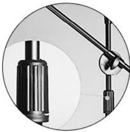
Screw for Main Pole Height Adjustment