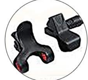
It comes with two clips