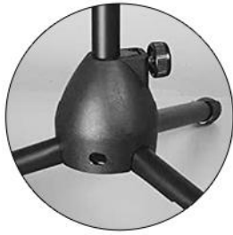
Stable Nylon Tripod Base