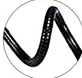
Free to bend contraction