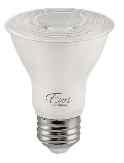
Available only as a twin-pack. (EP20-7W6020e-2 twin-pack contains 2 LED Bulbs.)