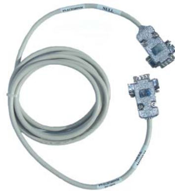
ECD2409NM NULL MODEM Cable, DB9 to DB9, male to male, 6 ft length.