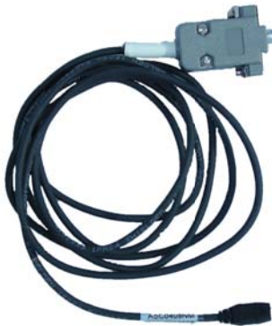
ASC0409DC Cable, Diagnostics port & Programming for enclosed radio.