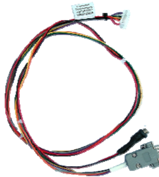
ASC3610DJ Data interface cable w/jack for power input.