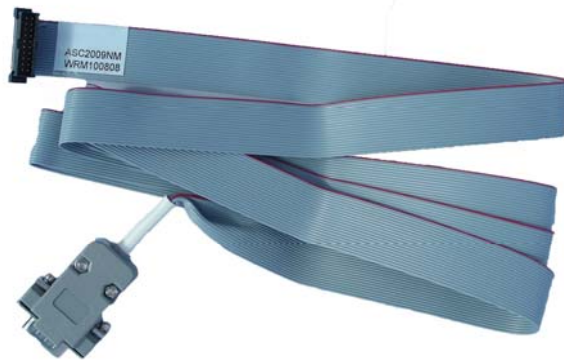
ASC2009DC Diagnostics and Programming Cable.

The following cables are available for the Enclosed and board level Serial radios.