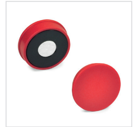
View of magnetic surface