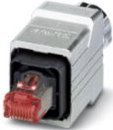
RJ45 connector, IP67, with push/pull interlocking (version 14), metal housing, for 1 Gbps, for 24 ... 25 AWG stranded conductors

Please be informed that the data shown in this PDF Document is generated from our Online Catalog. Please find the complete data in the user's documentation. Our General Terms of Use for Downloads are valid ( http://download.phoenixcontact.com )