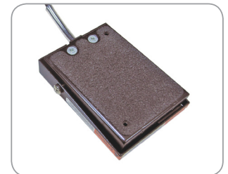
Optional hands free foot pedal.