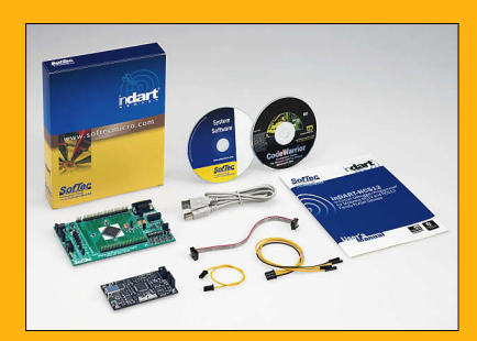
An inDART-HCS12 Design Kit Package